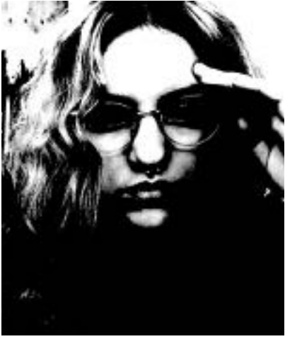
FIGURE IT OUT! YOU CAN DO IT; YOU CAN CHANGE YOUR LIFE -IF YOU WANT- IF YOU TAKE IT! IT'S SITTING ON THE PATH AT YOUR FEET AND MAKING A MOURNFUL MOANING SOUND (YOU HEARD IT ONCE BEFORE OUT OF YOUR BEDROOM WINDOW ON A SWELTERING SUMMER NIGHT). I KNOW YOU FEEL LIKE YOU'RE ALONE BUT IT'S ALWAYS GOING TO BE THERE FOR YOU IF YOU JUST TAKE THE FIRST STEP; TRUST ME!